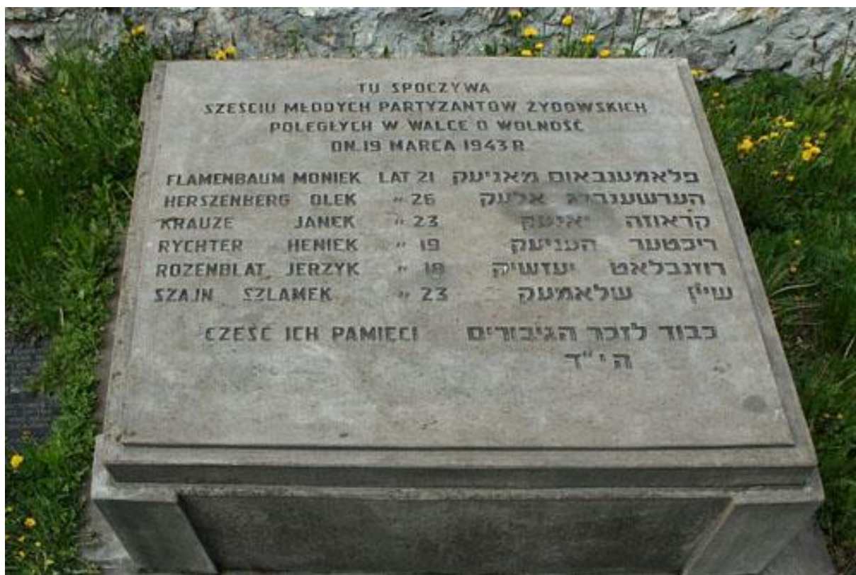
The image of the grave many years ago, today partly is difficult to read