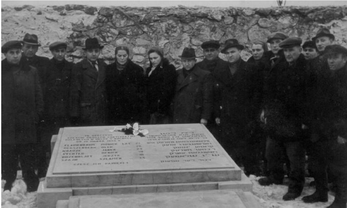
Czestochowa 1946 - A memorial ceremony for the six partisans

התאחדות יוצאי מחוז צ'נסטוחוב (דור ההמשך ער) בישראל Association of Częstochowa District Jews in Israel ת.ד. 65050 תל אביב 61650 – טל: 03-6749322 – P.O.B 65050 Tel Aviv 61650 E mail: czestochowajewsinsrael@gmail.com